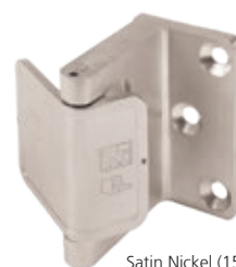
Satin Nickel (15)