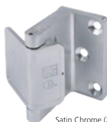
Satin Chrome (26D)