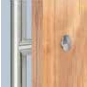
Single pulls are thru-bolt mounted with round end-caps

IN (MM), (†) CENTER-TO-CENTER. NOT ALL COMBINATIONS OF STANDARD LENGTHS, TYPES & FINISHES ARE STOCKED. PLEASE REFER TO PRICE LIST OR CONTACT CANAROPA SALES AND SERVICE FOR DETAILS.