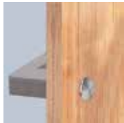
Single pulls are thru-bolt mounted with round end-caps