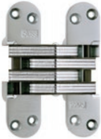
S220 5½" (140mm)