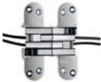
S220PT 5½" (140mm) Power Transfer