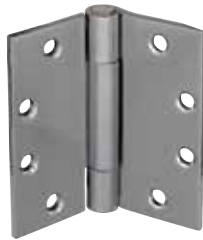
3 knuckle, flush tip