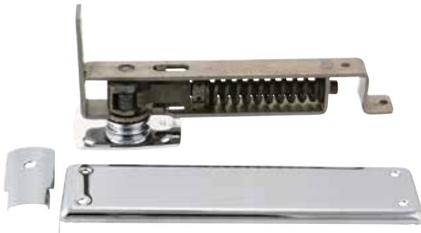
Horizontal Spring Pivot