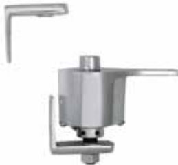
Spring Gate Pivot