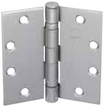
5 knuckle, bottom tip