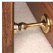
MAGNETIC DOOR HOLDERS AND STOPS