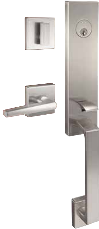
PLATO SATIN NICKEL