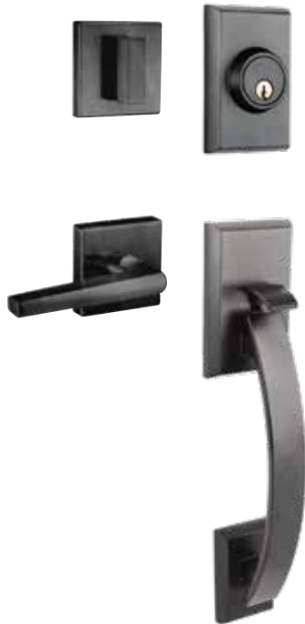
ARCO MATTE BLACK