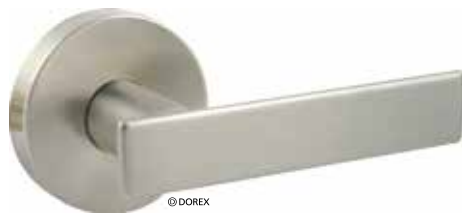
© DOREX THE FLAT SATIN NICKEL