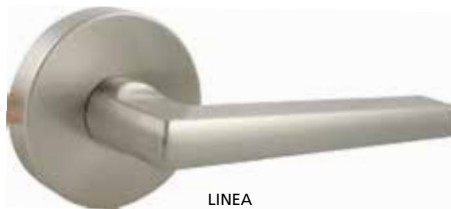
LINEA SATIN NICKEL