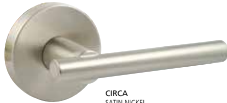
CIRCA SATIN NICKEL