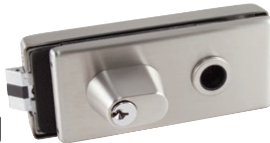
PF251 ENTRY (KIK CYLINDER)